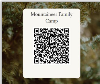
QR code link to HipCamp registration for Mountaineer Family Camp