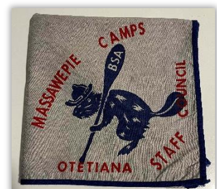
1960 Camp Voyageur staff neckerchief