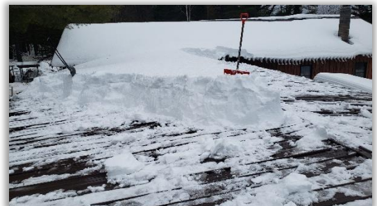
Up to 4 feet of snow on the Maintenance Shop roof!

Since there is no National Camp School this year at Massawepie, join us to help finish projects and prepare camp before Scouts and Staff arrive! Meals will be provided June 23-27 out of Gannett Lodge. Be sure to RSVP!