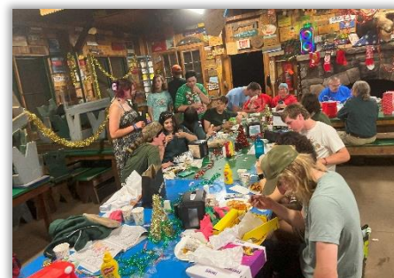
Christmas in July party for the staff!

Take a photo of the QR link above with your smartphone or click on this hyperlink!