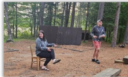
Election of the new Chair!

At the end of 2023, our account balance was $4,913. As of September 30, after the income and expenses shown below, our balance is up to $5,089. Extra funds in our account are typically eventually used for staff recognition or donated toward a project or to the Square Foot Fund. This year, we did give out 4 "3-year staffer" shirts to those eligible on the 2024 staff. Again, thanks to all of the MSAA members, donors and volunteers for making these projects and recognitions possible!