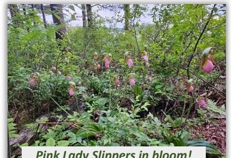
Pink Lady Slippers in bloom!