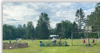
Sports in action!