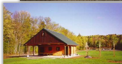
Sports Building, June 2000

The Sports and Mountain Bike Area means a lot to me. I had the best time as a Scout in summer 2004 taking Cycling merit badge. I was on Sports staff in high school and college from 2005 – 2010 and they are still the fondest memories of my life.