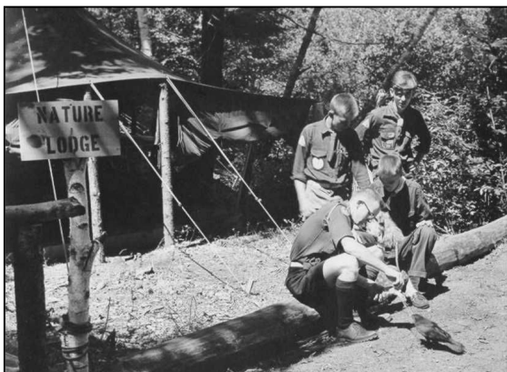
Pioneer Nature "Lodge" in 1952!