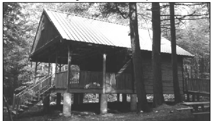
Pioneer Ecology-Conservation (ECON) Lodge, today!