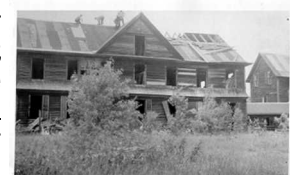
PARK HOUSE BEING BURNED, 5/16/53