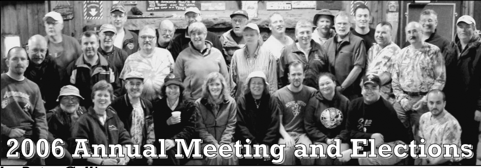
by Peter Collinge

Go to www.monroecounty.gov/parks-oatka.php for a map and more park information.